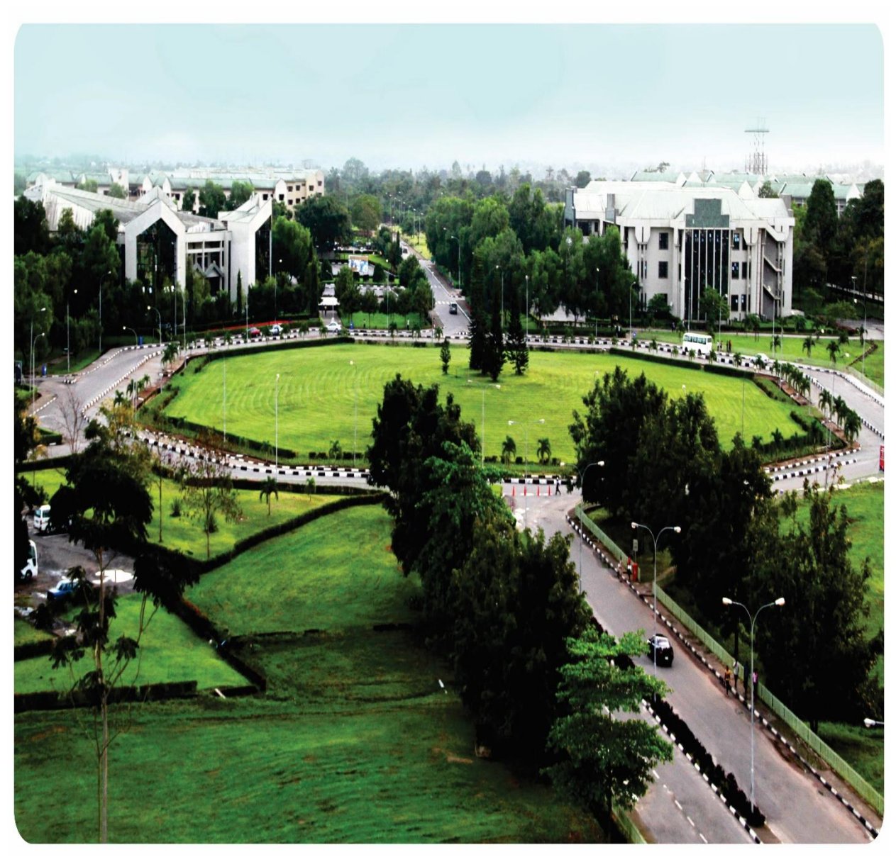
Covenant University Landscape