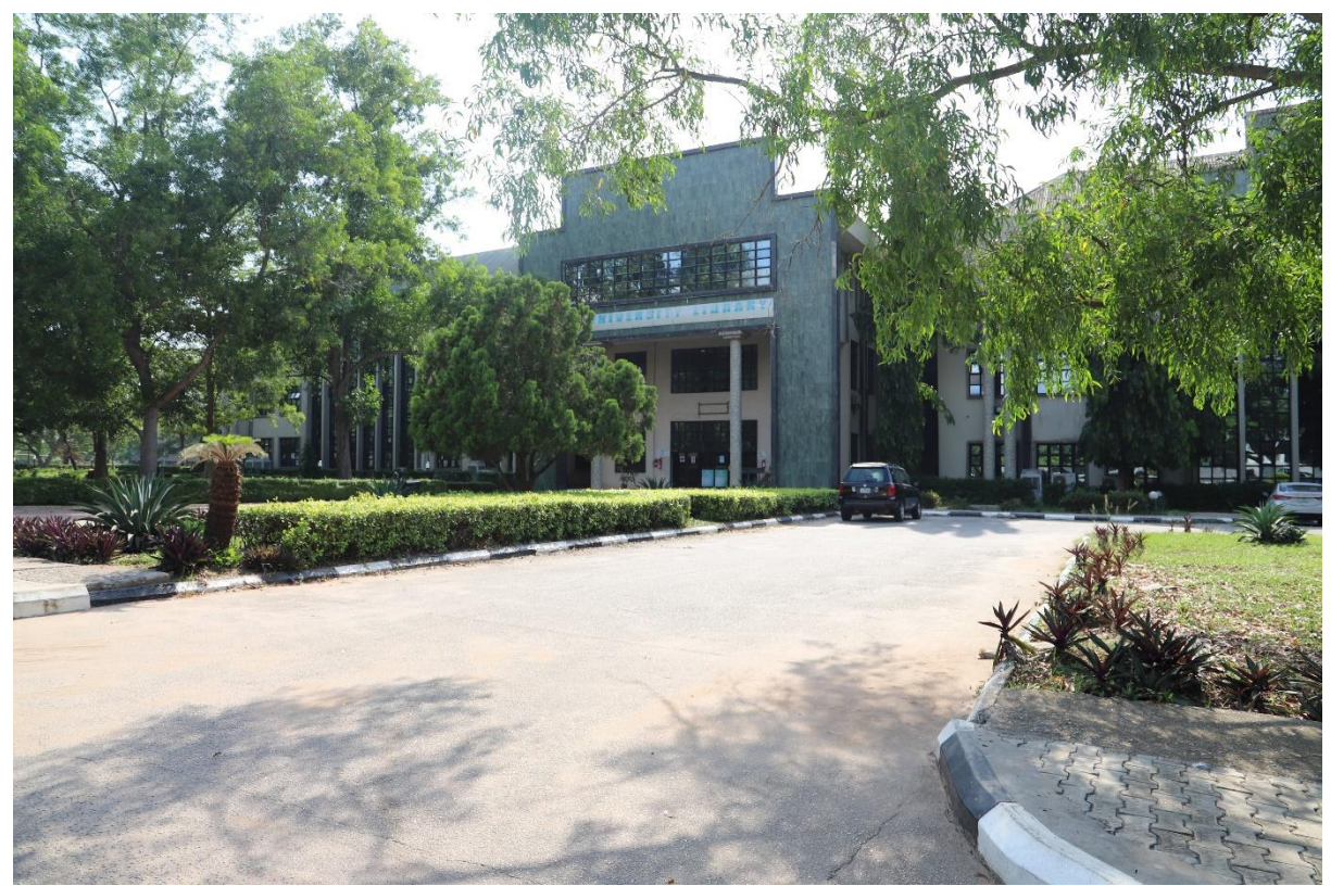
Covenant University Center for Learning Resources