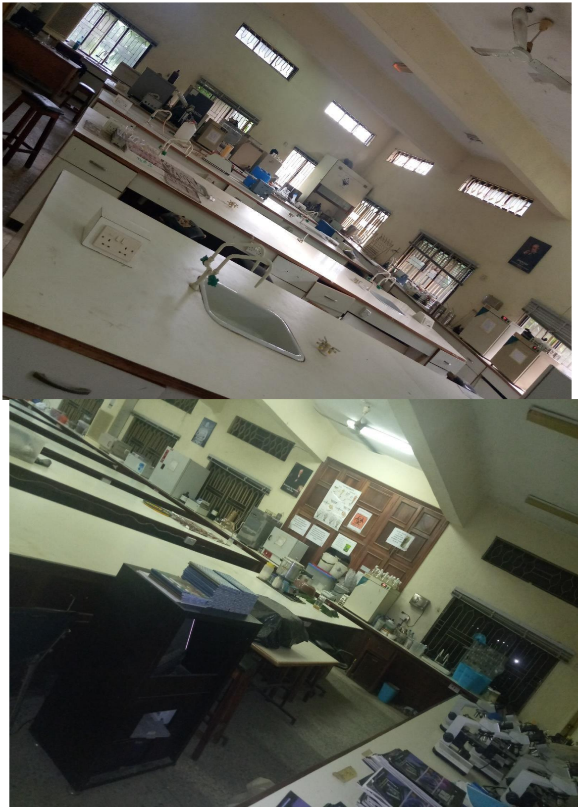
Sections of Biology and Microbiology Laboratories, Covenant University, Ota