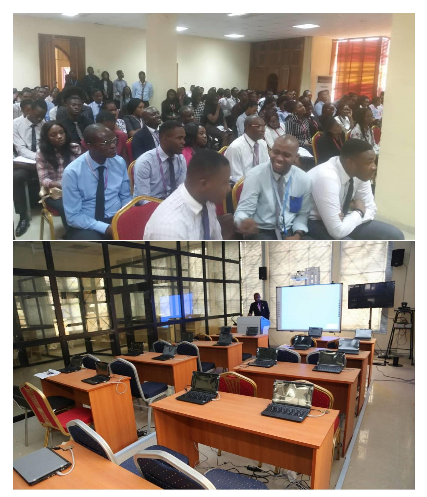
E-Learning facility at the Centre for Learning Resources (Library)