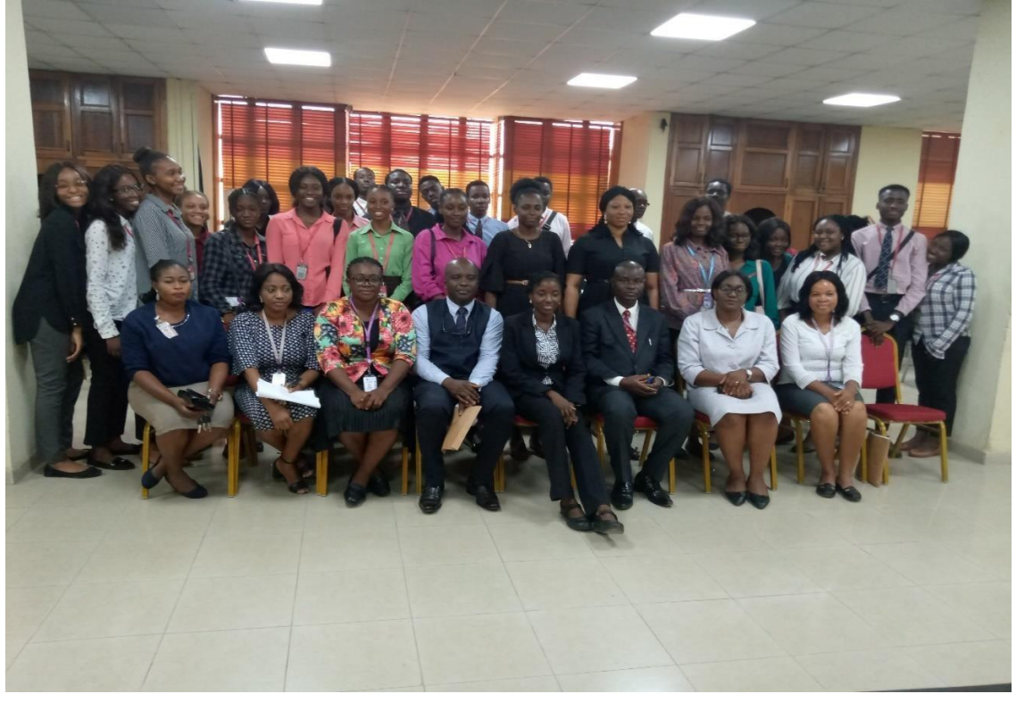
Pix after a Town and Gown Seminar Session at the Department of Biological Sciences