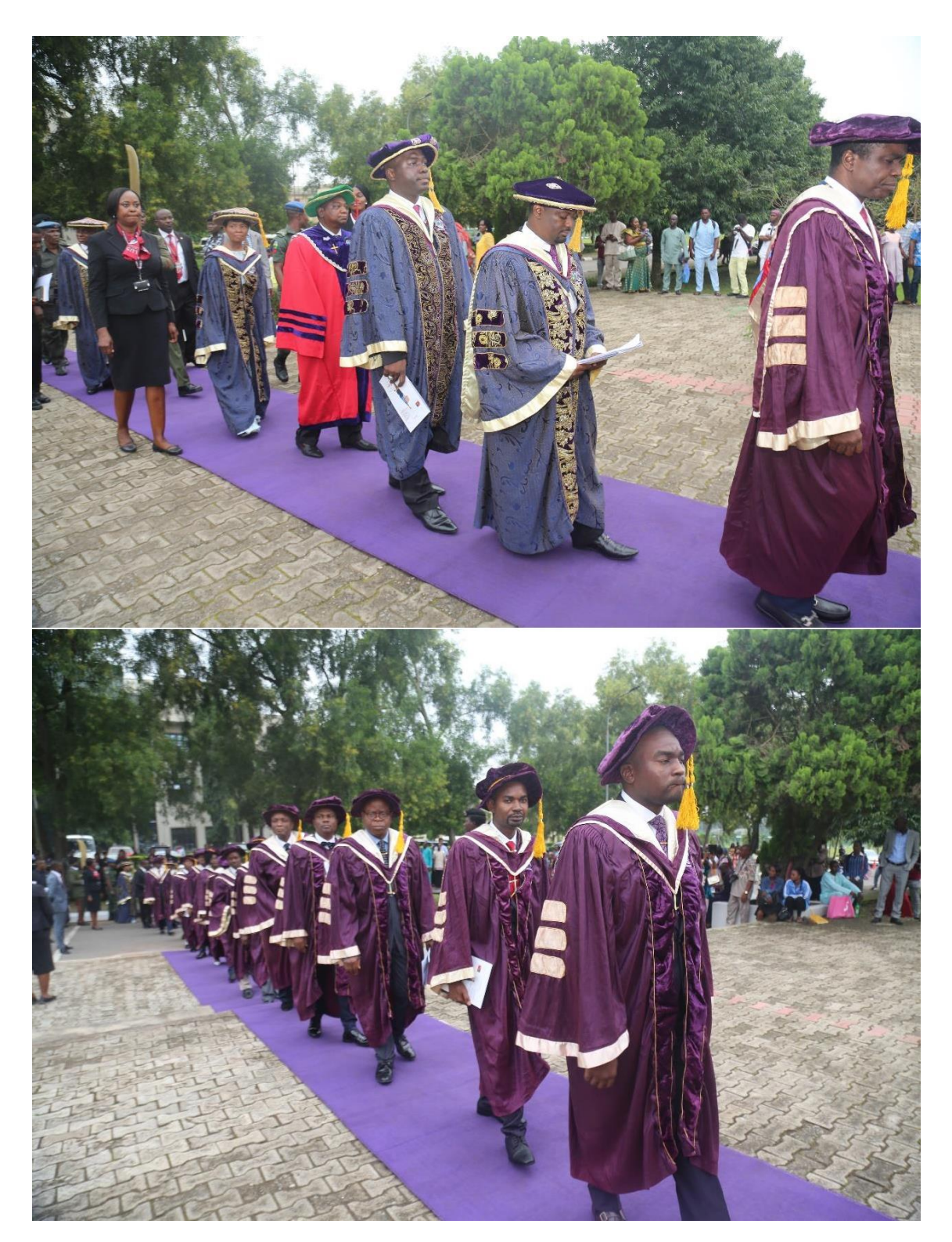
(Top & Down) Members of the Board of Regents in academic procession during a Convocation Ceremony