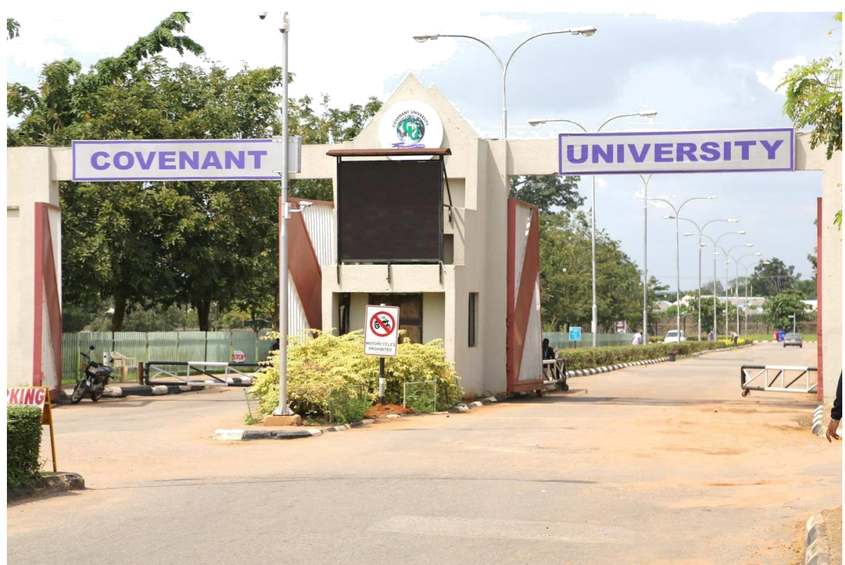
Covenant University Gate