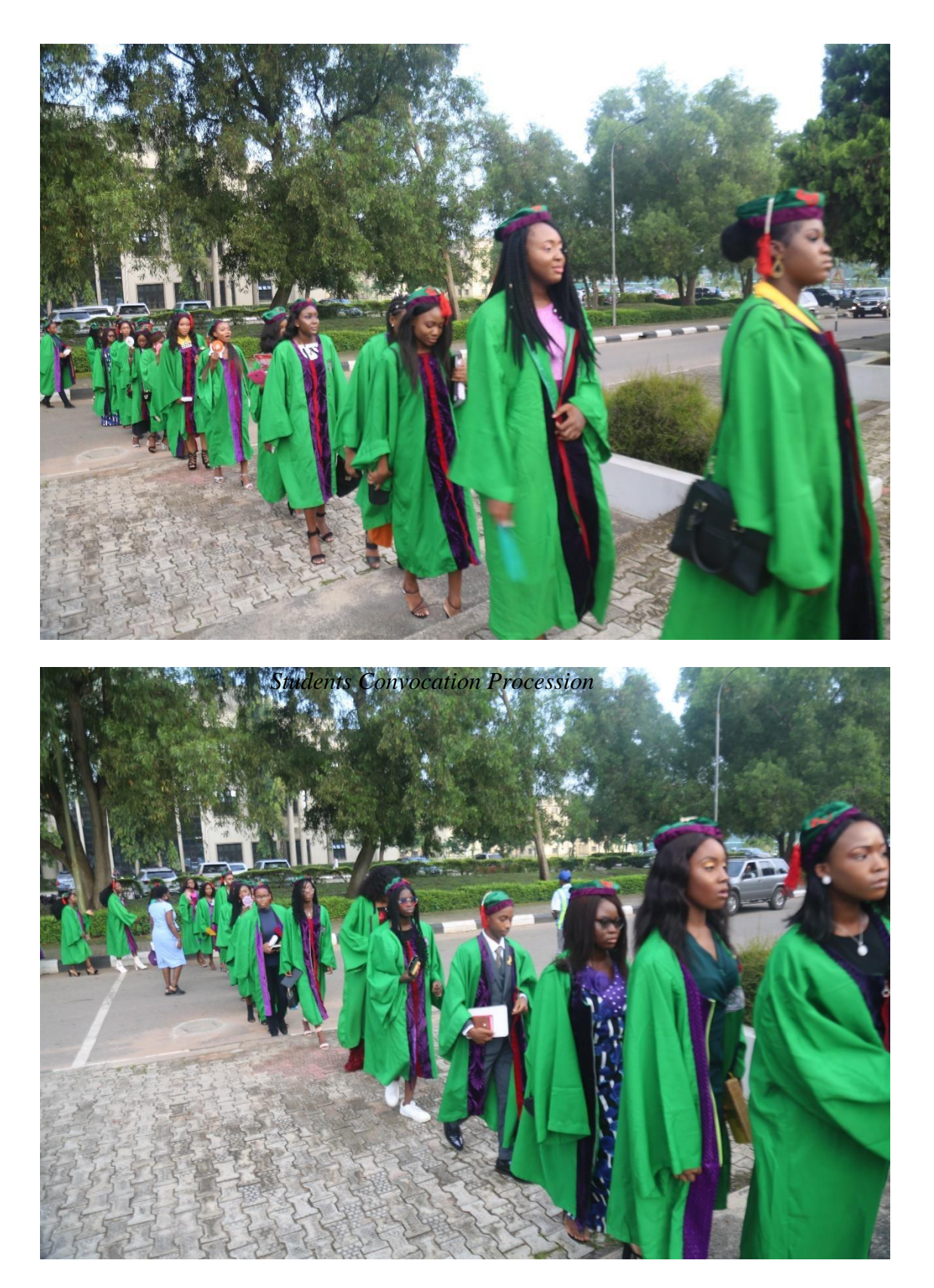
Students Matriculation Procession