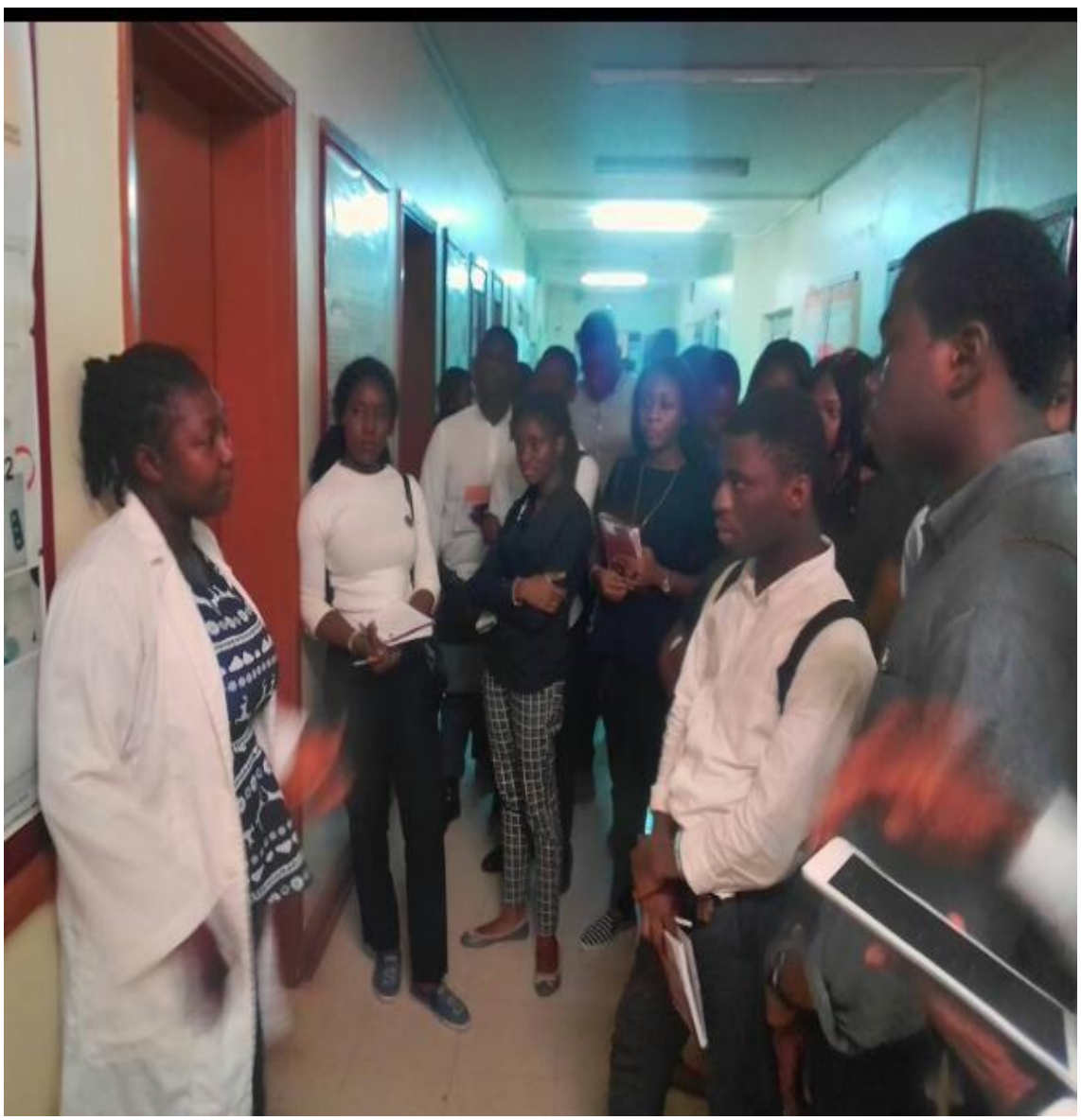
Students on excursion to IITA Ibadan