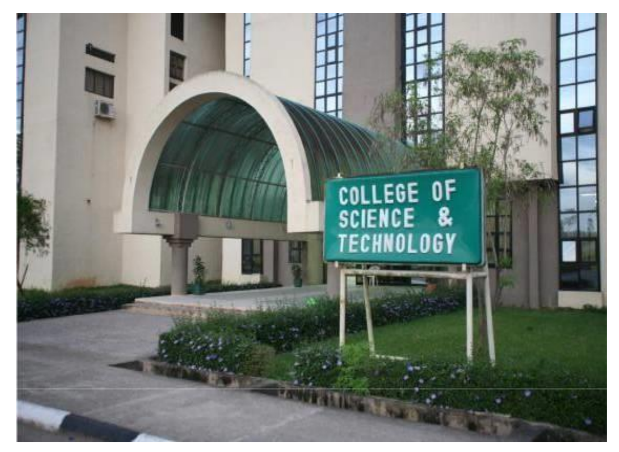
College of Science and Technology

At the inception of Covenant University in 2002 and up till 2009, there were three Colleges: College of Business Studies (CBS), College of Human Development (CHD) and College of Science and Technology (CST). In 2009/2010 academic session, the number of Colleges in the University was reduced to two with the merging of the College of Business Studies and the College of Human Development to form the College of Development Studies (CDS). In the 2014/2015 academic session, the number of Colleges was increased to four. The four Colleges are the College of Business and Social Sciences (CBSS) now College of Management and Social Sciences (CMSS), College of Leadership and Development Studies (CLDS), College of Engineering (CoE) and College of Science and Technology (CST).